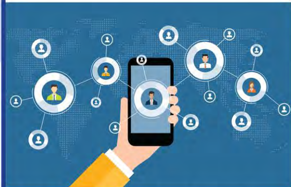
GDPR – Employees, Suppliers and Third Parties Module