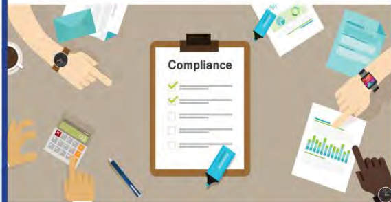
GDPR – Organisations' Operations Module