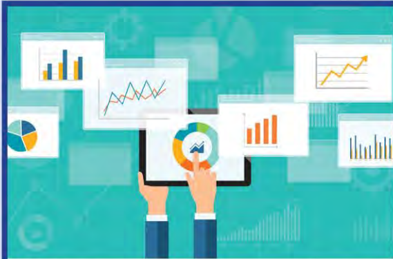
GDPR – Data Protection Module